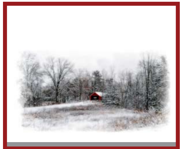
"ETHEREAL BRIDGE"