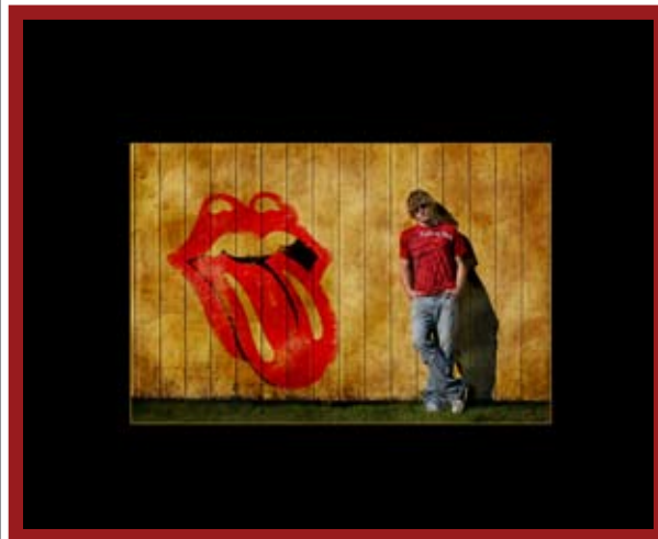
"LIKE A ROLLING STONE"

1217 Water Street Stevens Point, WI 54481 715-341-9001 ottophotography@sbcglobal.net