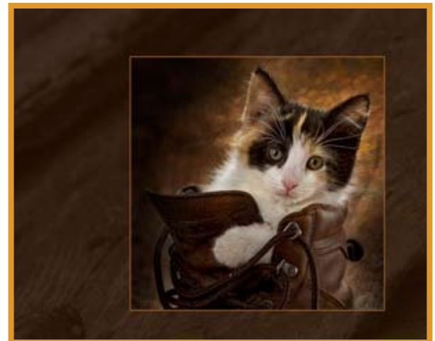
"PUSS IN BOOT"