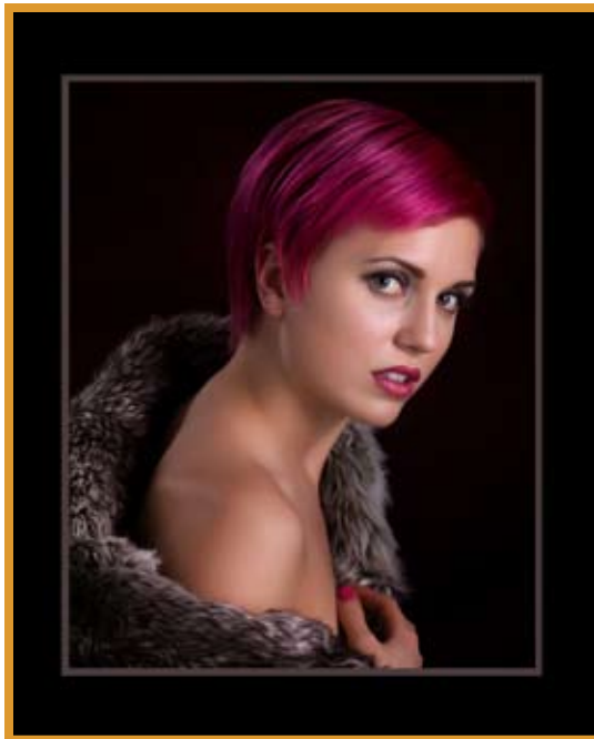
"HOT PINK"

866 115th Street Amery, WI 54001 715-268-9363 kmc_photo@yahoo.com